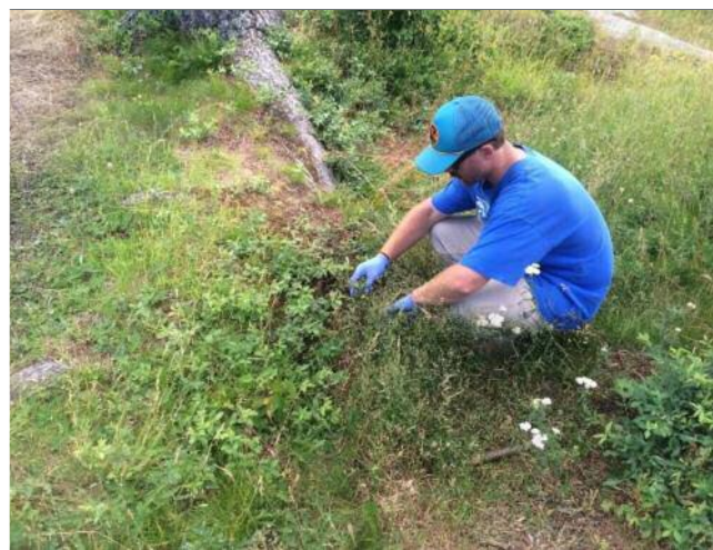
CEMP Field Tech gathers berries for metals analysis near the Eagle Mine site.