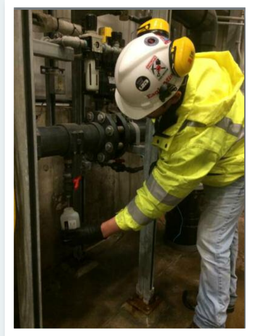
Eagle Mine Technician sampling the Temporary Development Rock Storage Area. CEMP participates in split sampling with Eagle Mine to verify results.