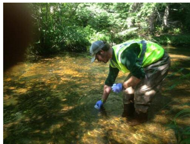
CEMP Field Tech samples surface water on a tributary near the Eagle Mine.