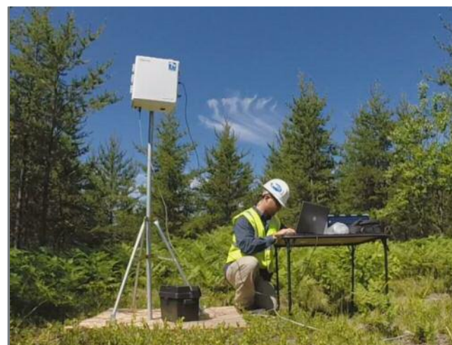
CEMP Field Tech deploys the ADR-1500 Portable Air Monitor near the Eagle Mine.