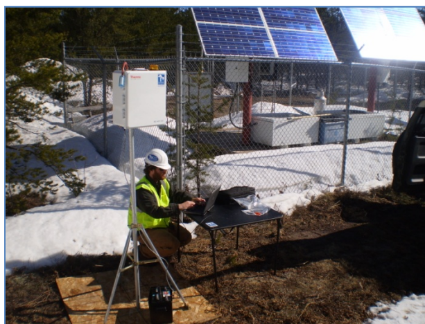
SWP Field Technician Hunter King monitoring air quality using a portable monitoring device next to Eagle Mine's air station.