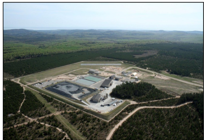
Eagle Mine, Spring 2014.