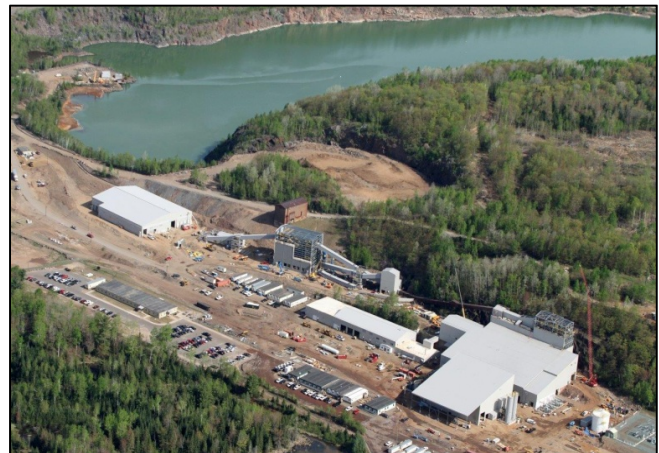
Humboldt Mill, Spring 2014.