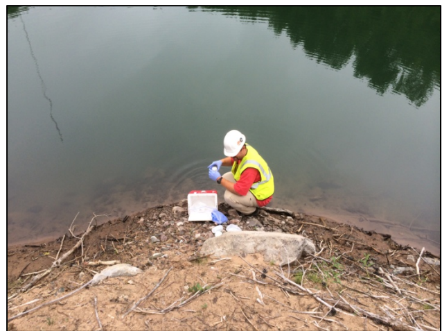
CEMP Field Technician Hunter King collecting a water sample from the Humboldt Mill Tailings Disposal Facility.