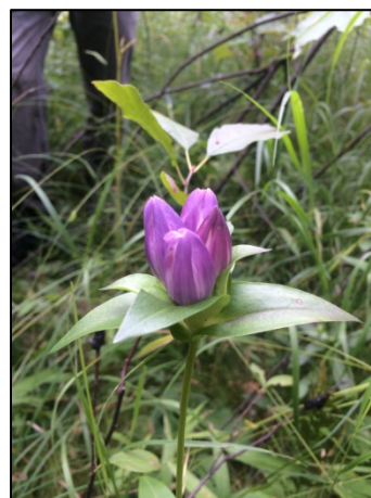
The state threatened Narrow-leaved gentian (Gentiana linearis) inventoried along the Salmon Trout River, August 2014.