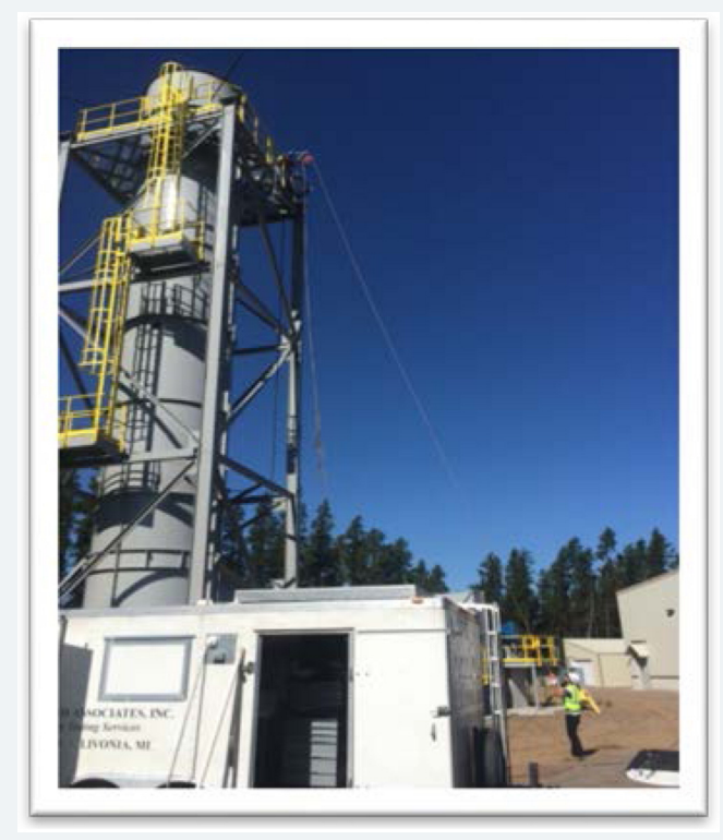
The CEMP deployed the portable air monitoring equipment to collect ambient air quality data at the Mine Ventilation Air Raise (MVAR) during the Michigan DEQ required stack test on September 16.