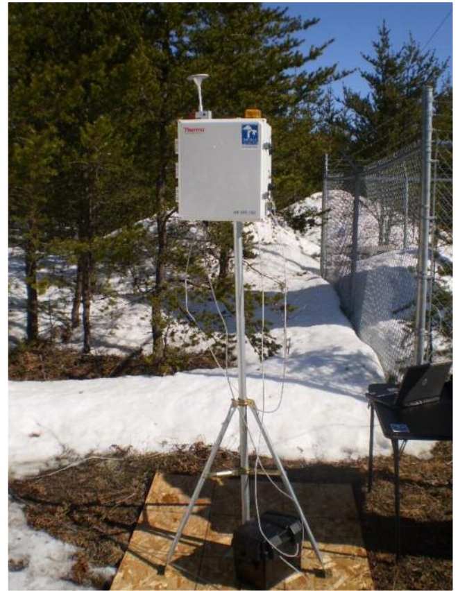
The portable air quality monitoring unit set up at a monitoring station near the Eagle Mine.