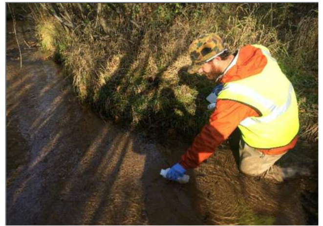
CEMP Field Technician samples surface water at a tributary of the East Branch Salmon Trout River, located near Eagle Mine