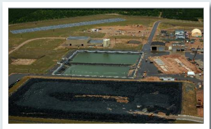
This photo shows the TDRSA in the foreground, with the water storage basins between that and the water treatment plant at the Eagle Mine.